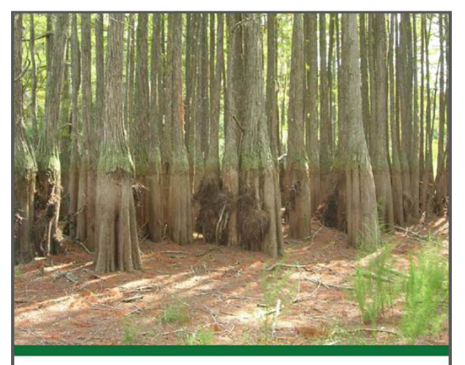
The Impact of Drought on Coastal Ecosystems in the Carolinas

The report provides a synthesis and analysis of peerreviewed literature examining drought impacts on coastal ecosystems. Literature reviewed for this report indicates that drought is discussed primarily in terms of the hydrology-related impacts that affect coastal ecosystems, such as changes to river discharge, freshwater inflows, water level, and water quality. The severity of these effects depends upon the longevity and recurrence interval of the drought event(s) and may be compounded by other anthropogenic stressors on the system. In addition, some drought-related research considers how sea level interacts with freshwater precipitation and runoff to influence the salinity levels experienced by these systems. The review